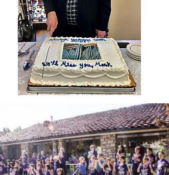
Vacation Church School