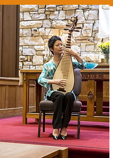
Shenshen delights with the pipa