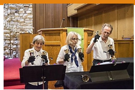
Hurray for hand bells!