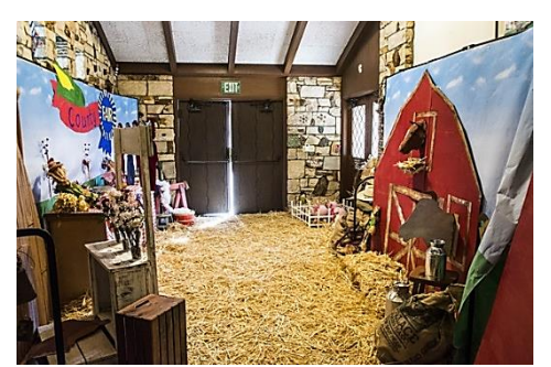
Vacation Church School