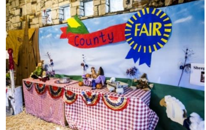
Vacation Church School