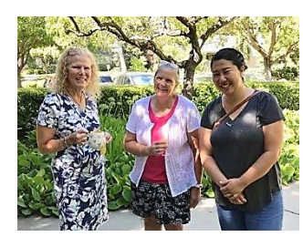
All who like to sew, either by hand or machine, are invited to join this

group every second Friday of the month, Room 1, downstairs at 1:30 PM. Ringing a portable doorbell at the patio door entrance will bring someone up to let you in. No need to bring anything with you as everything needed is supplied, including sewing machines. Join us!